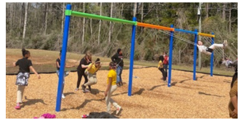
PLAYGROUND TRACK FIELD